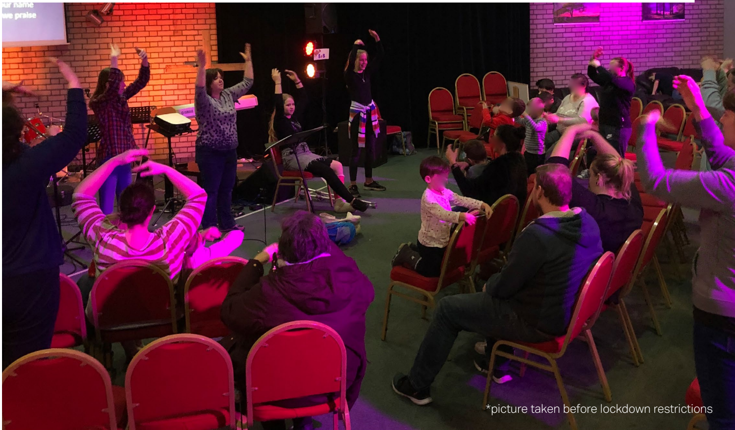
*picture taken before lockdown restrictions