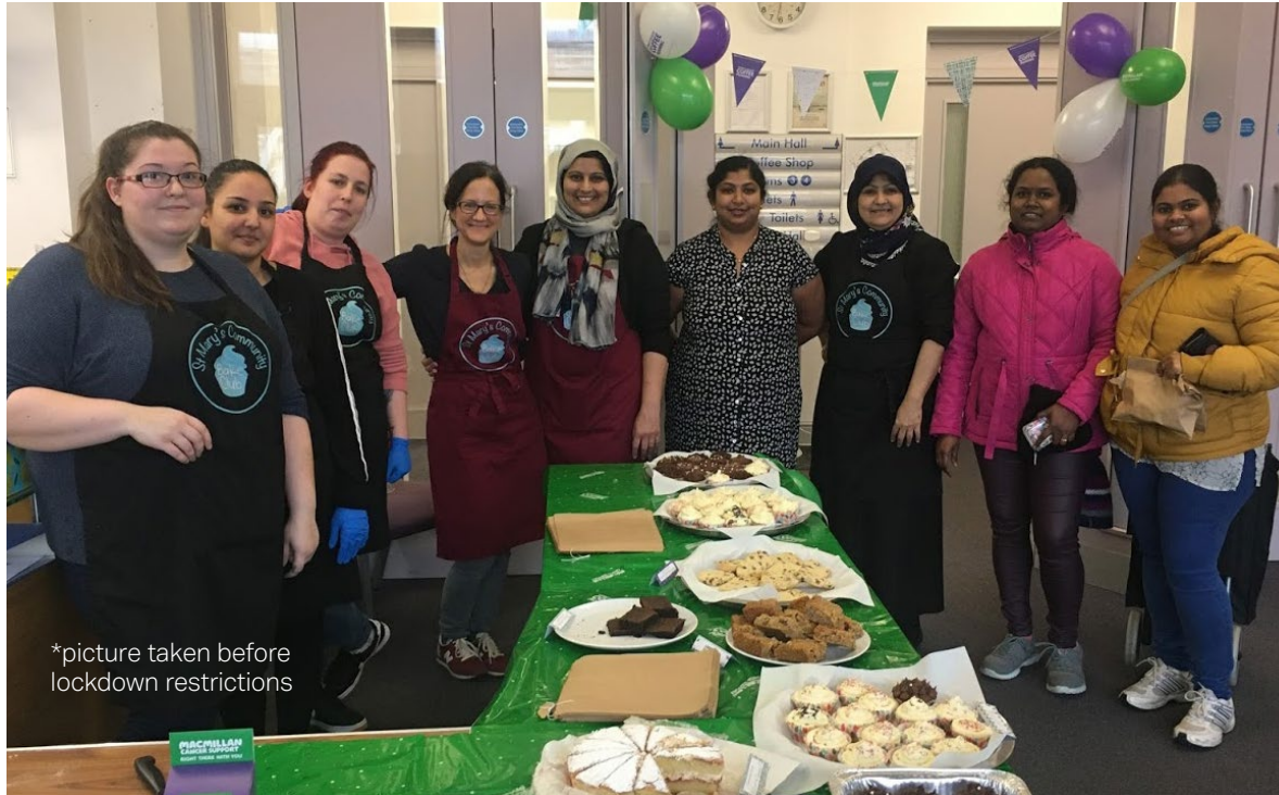
*picture taken before lockdown restrictions

We recruited a Coffee Shop co-ordinator who, despite starting work on the first day of lockdown, was able to open for the less restricted parts of the year and made some meaningful connections with the local community.